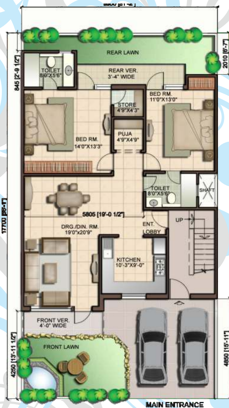
GROUND FLOOR PLAN BUILT UP AREA=1312 SQ.FT.

CARPET AREA: 2417 SQ. FT. PLOT AREA: 1809 SQ. FT. BUILT UP AREA: 3190 SQ.FT.