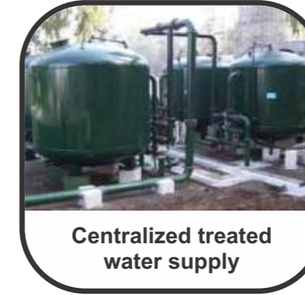
Centralized treated water supply