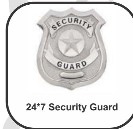
24*7 Security Guard