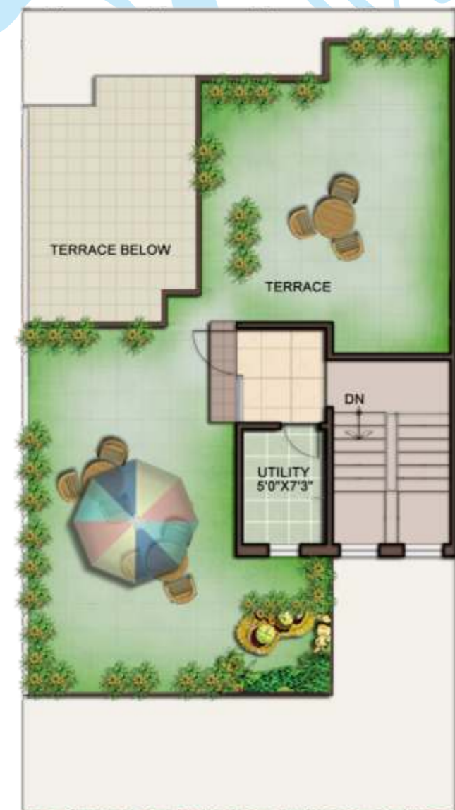
SECOND FLOOR PLAN BUILT UP AREA=213 SQ.FT.