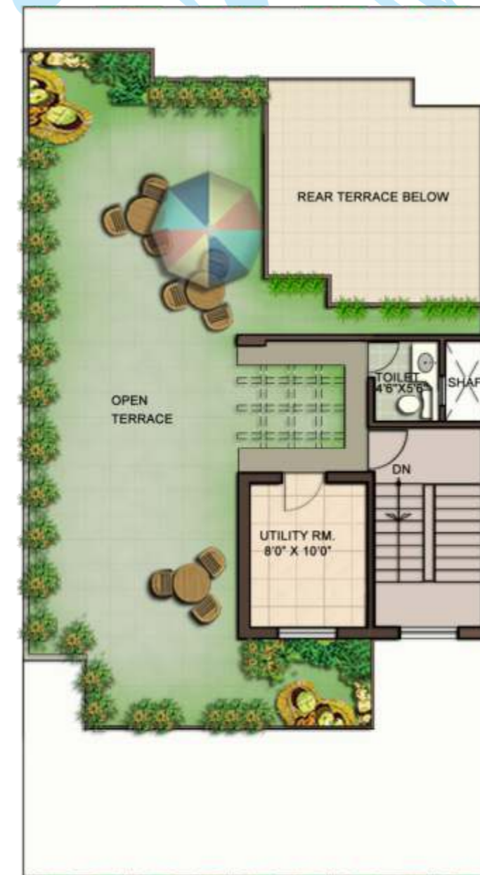
SECOND FLOOR PLAN BUILT UP AREA=330 SQ.FT.