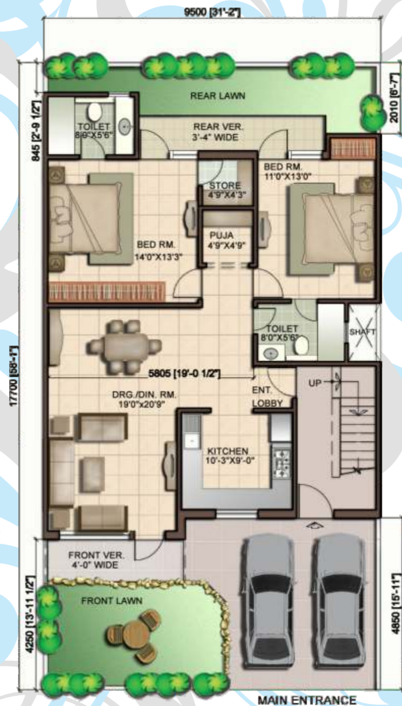
GROUND FLOOR PLAN BUILT UP AREA=1312 SQ.FT.

CARPET AREA: 2035 SQ. FT. PLOT AREA: 1809 SQ. FT. BUILT UP AREA: 2727 SQ.FT.