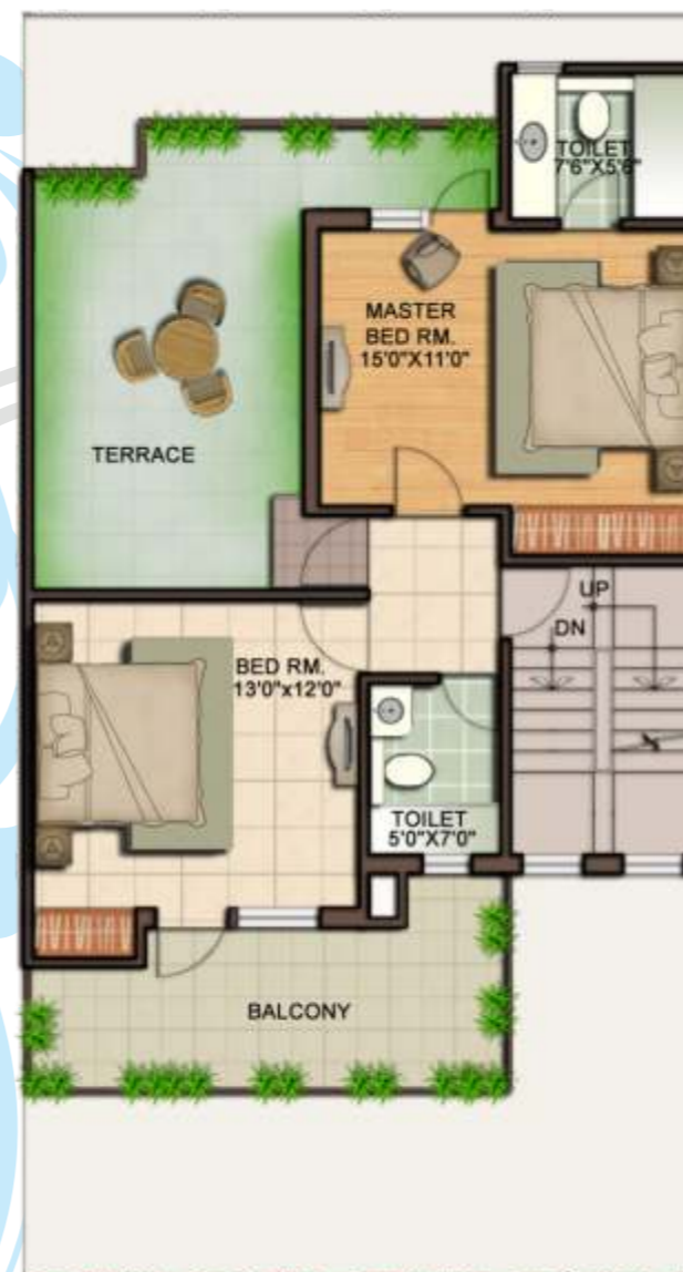
FIRST FLOOR PLAN BUILT UP AREA=842 SQ.FT.