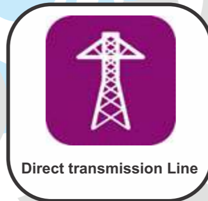
Direct transmission Line