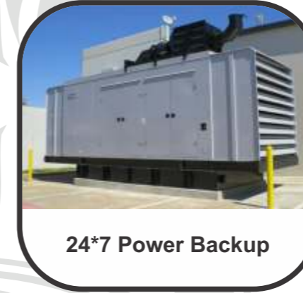
24*7 Power Backup