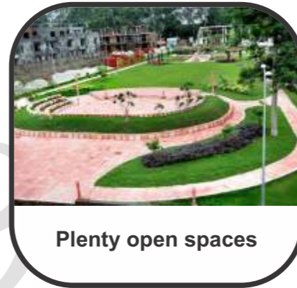
Plenty open spaces