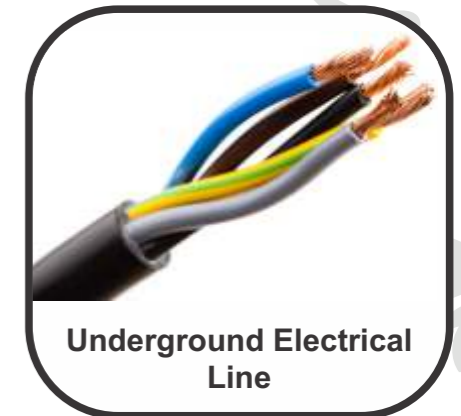
Underground Electrical Line