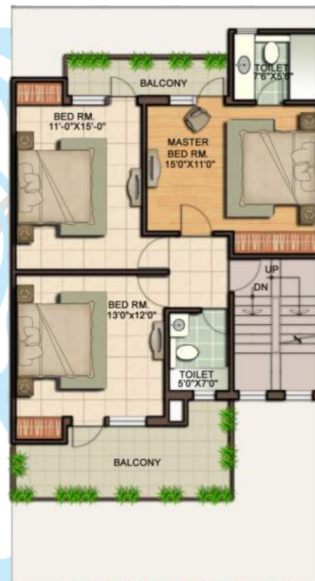
FIRST FLOOR PLAN BUILT UP AREA=1007 SQ.FT.