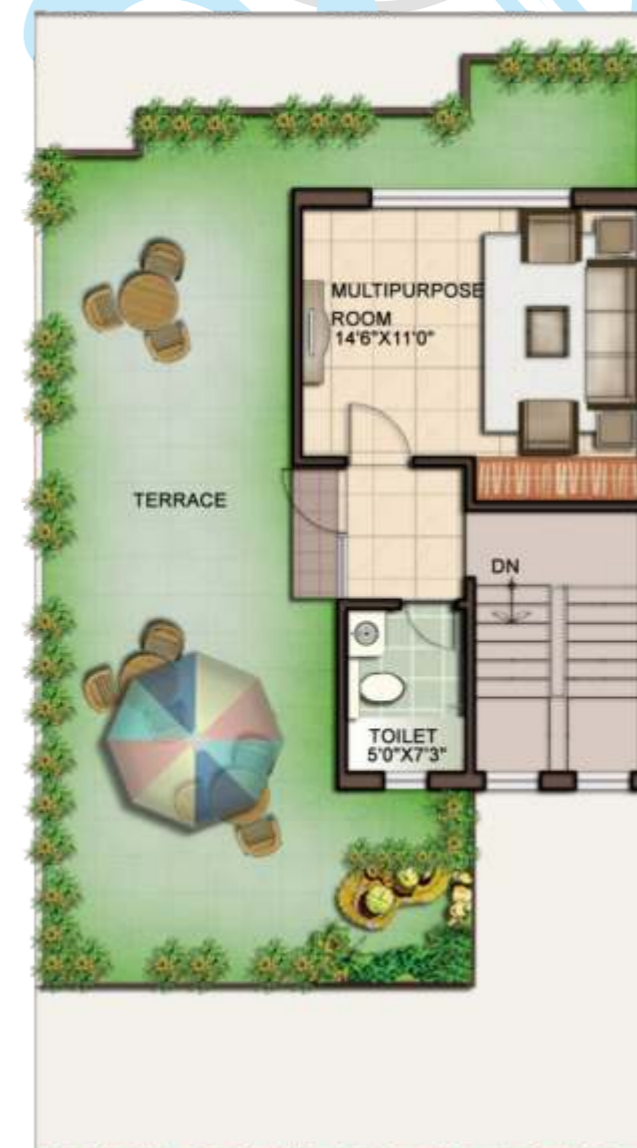
SECOND FLOOR PLAN BUILT UP AREA=398 SQ.FT.