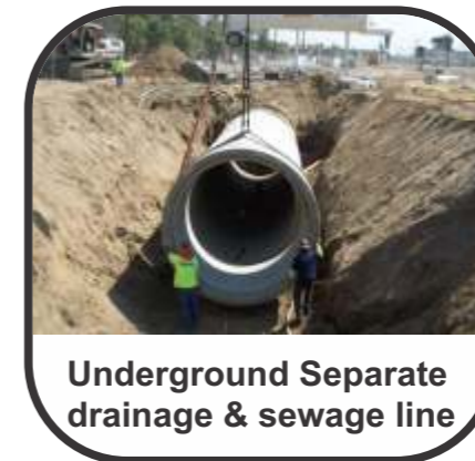
Underground Separate drainage & sewage line