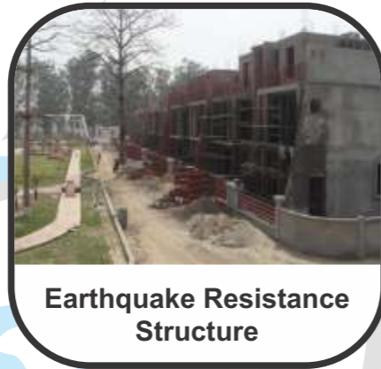
Earthquake Resistance Structure