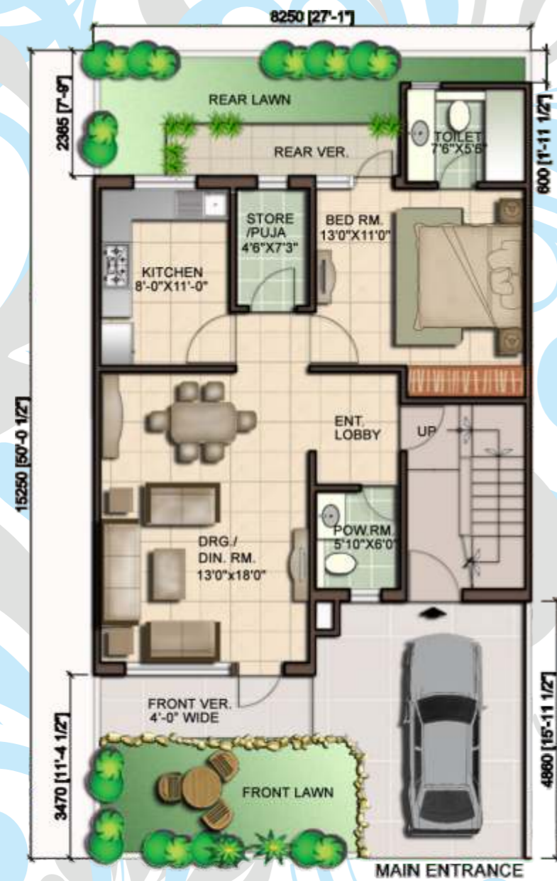
GROUND FLOOR PLAN BUILT UP AREA=998 SQ.FT.

CARPET AREA: 1497 SQ. FT. PLOT AREA : 1353 SQ. FT. BUILT UP AREA : 2053 SQ.FT.