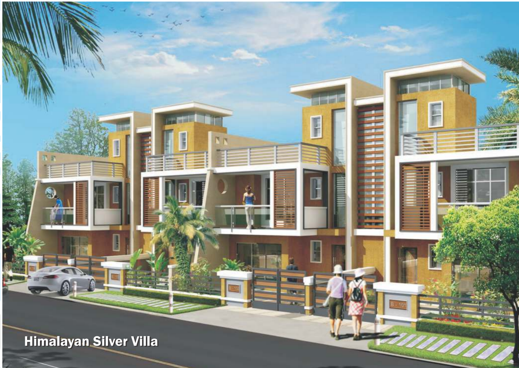
Himalayan Silver Villa