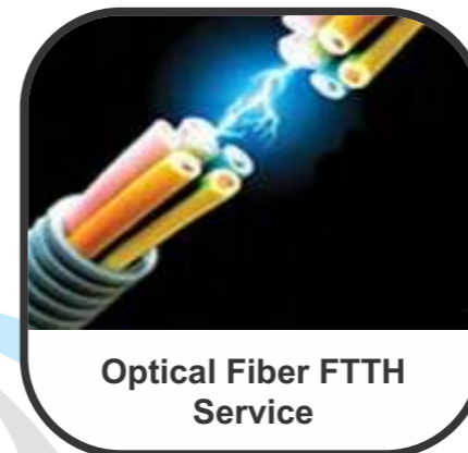
Optical Fiber FTTH Service