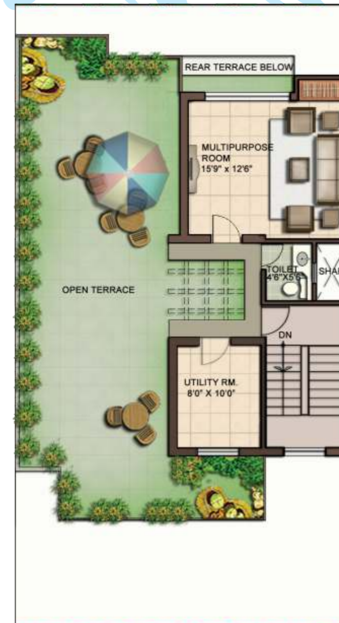
SECOND FLOOR PLAN BUILT UP AREA=597 SQ.FT.