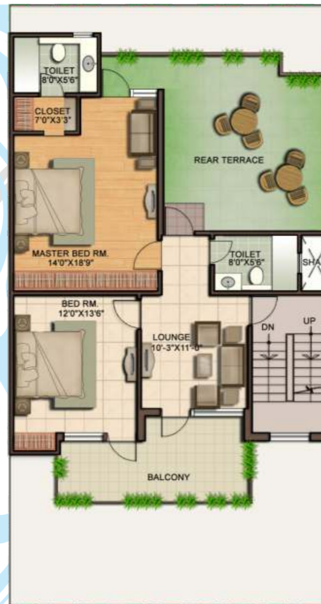
FIRST FLOOR PLAN BUILT UP AREA=1085 SQ.FT.