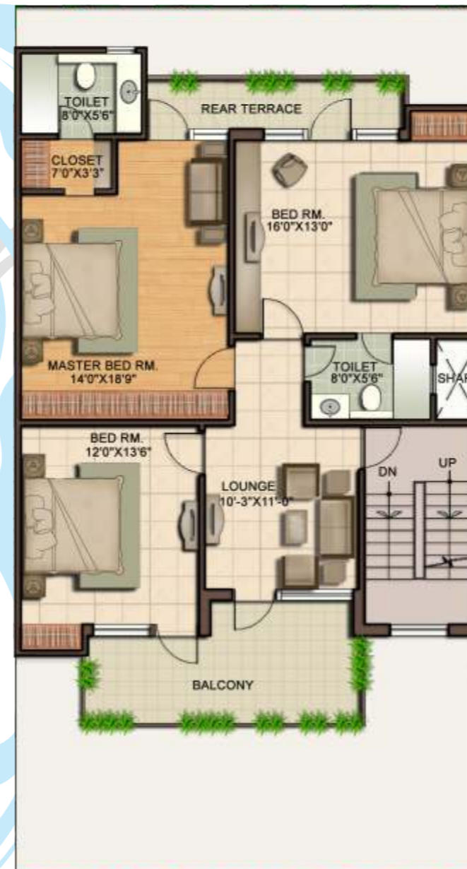
FIRST FLOOR PLAN BUILT UP AREA=1281 SQ.FT.