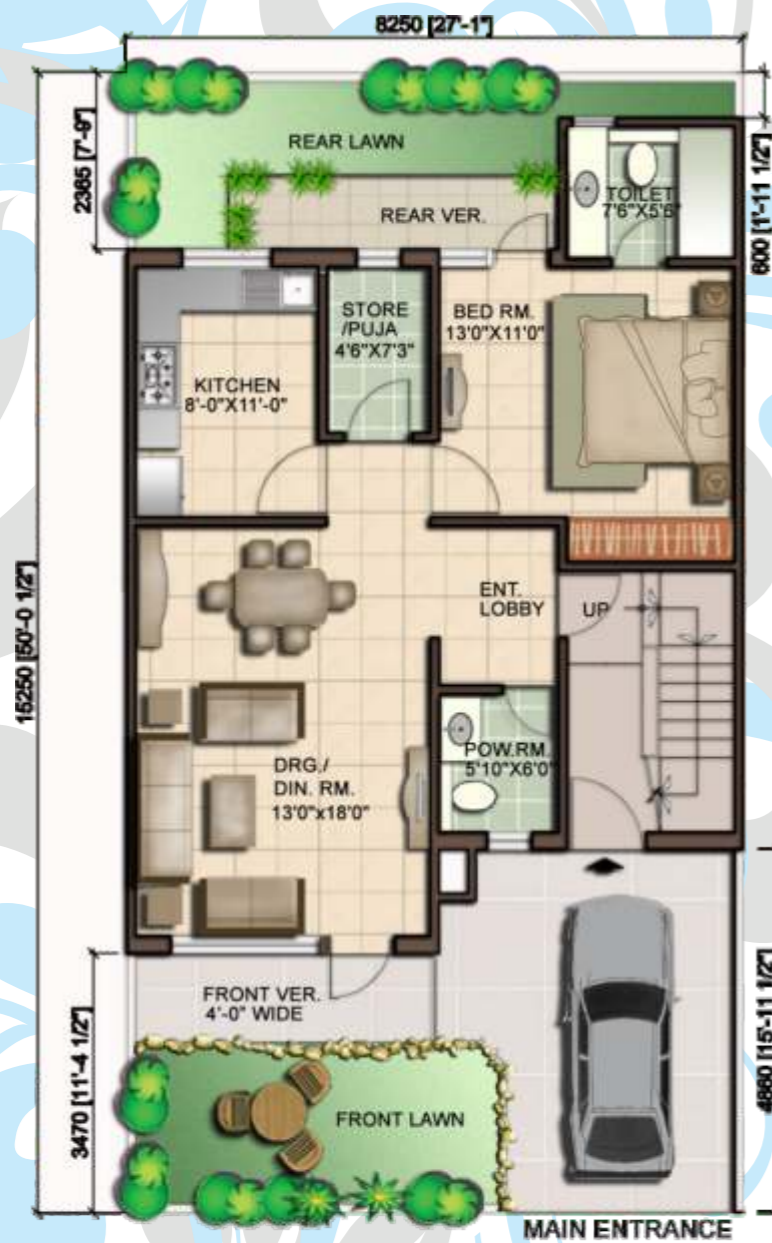
GROUND FLOOR PLAN BUILT UP AREA=998 SQ.FT.

CARPET AREA: 1810 SQ. FT. PLOT AREA : 1353 SQ. FT. BUILT UP AREA : 2403 SQ.FT.