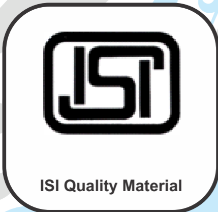
ISI Quality Material