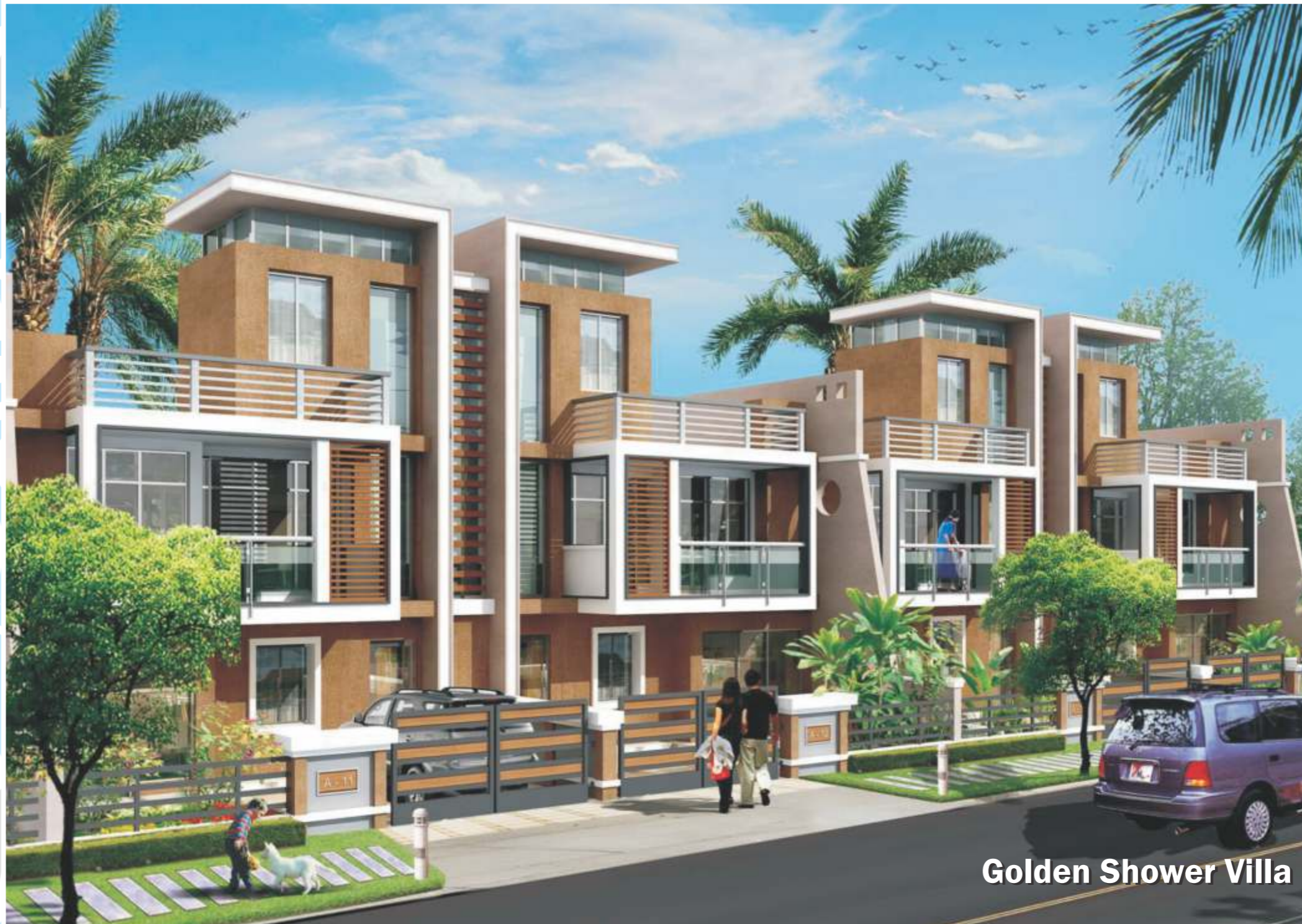
Golden Shower Villa