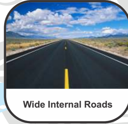
Wide Internal Roads